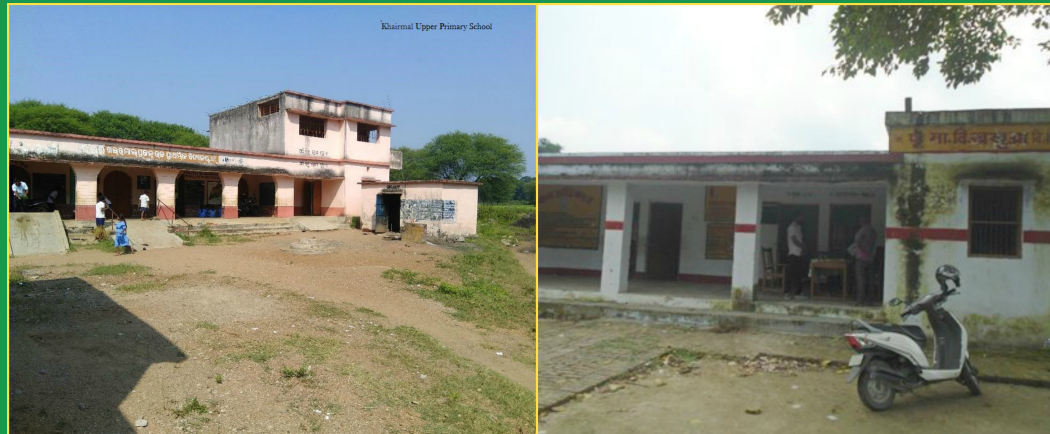
Uttar Pradesh and Odisha are the two new states that are getting added to eVidyaloka's growth story. The test connect got done at Junior High School, Khakhuwa in Uttar Pradesh and Khairmal center in Odisha