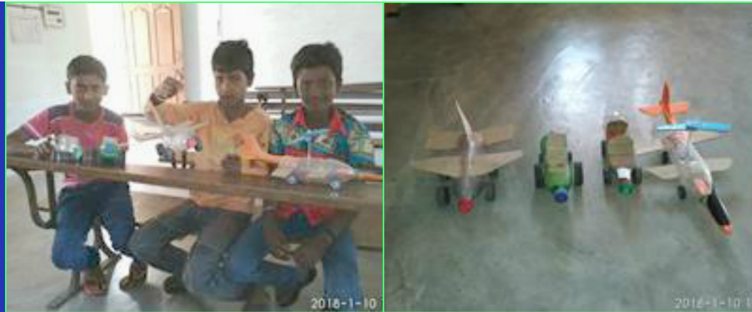
Students of Hanasoge center in Karnataka made airplane models with used water bottles, learning and spreading awareness on upcycling.